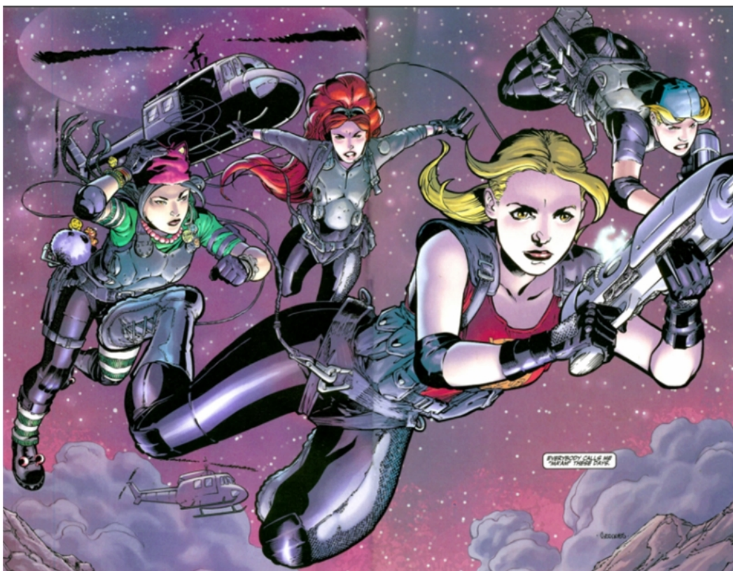
Figure 1.1 -- Buffy leads her new soldiers in the opening panels of issue #1. (Satsu is far left.)