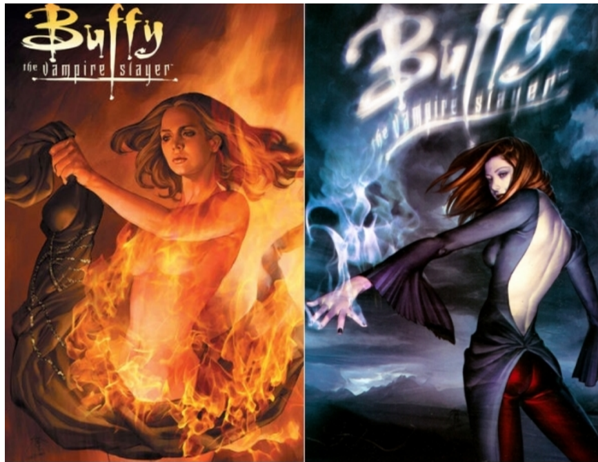
Figure 1.6 -- The Chen covers for issues #9 and #3 sexualize Faith and Willow, respectively.