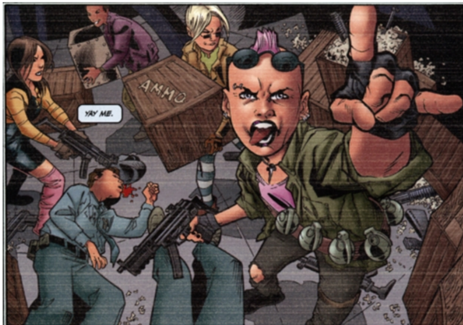
Figure 1.9 -- Rogue Slayers demonstrate that Buffy's new community is not a utopia.

Notably, Buffy is not advocating separatism; it is merely exploring the possibility. Buffy the Lesbian Separatist ultimately proves untenable; the Slayer outposts are not utopias. Over the course of the first fifteen issues, we learn that Buffy and her squad have been robbing banks in order to support their activities; the morality of their actions has become clouded, particularly when they begin fighting human enemies along with the vampires and demons more usually arrayed against them. In season three of the television series, Faith accidentally kills a human bystander, and the backlash destroys her relationship with Buffy; in season eight, Buffy calmly contemplates the possibility of having to kill human soldiers (#4). Additionally, a group of Slayers steals a weapons cache and apparently intends to fight with guns (#11) (Figure 1.9) —something that Buffy had in the past vehemently eschewed (or as Andrew puts it in issue #2, “No Slayer carries a gun, ever, end of talk, good talk”).