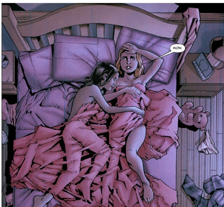
Figure 1.2 -- Buffy and Satsu after their first sexual encounter.