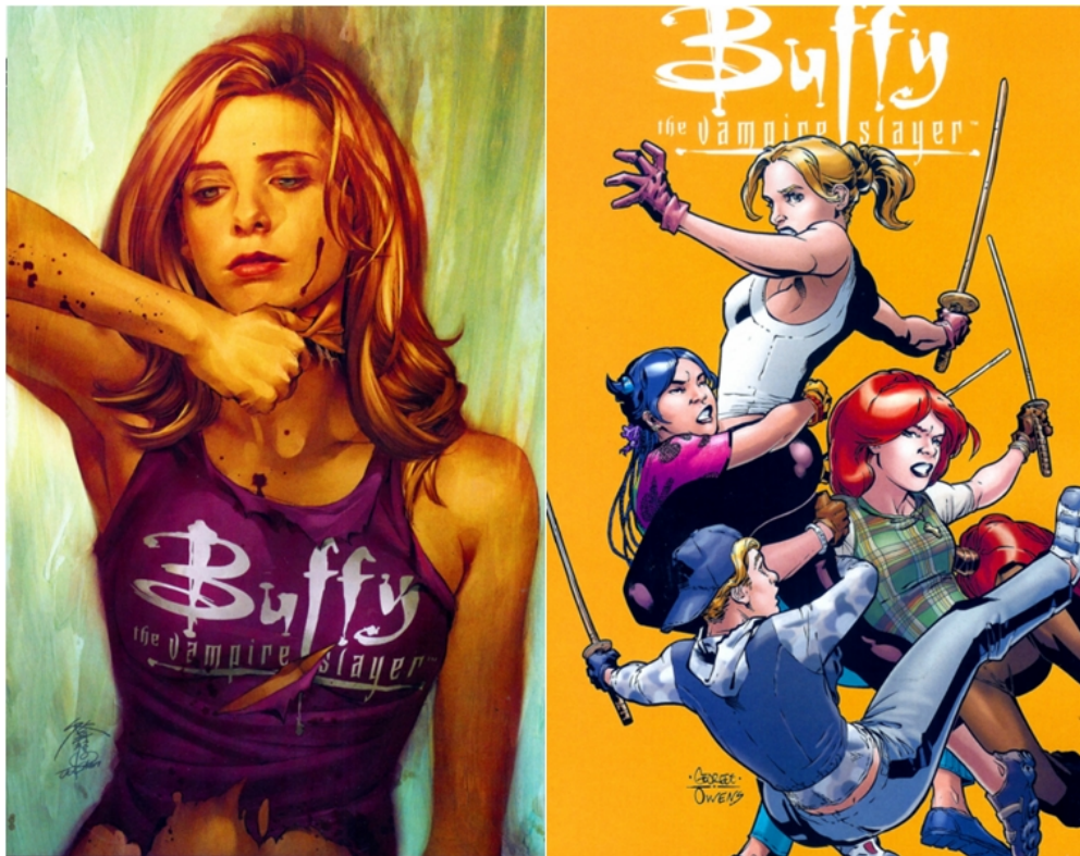
Figure 1.7 -- Buffy is more overtly sexualized on the first cover, while the second has what was referred to in the presentation as "gratuitous nipple action." However, this is not entirely the norm; one might compare the image from Figure 1.3, wherein Buffy is fully clothed but Angel and Spike are nude.