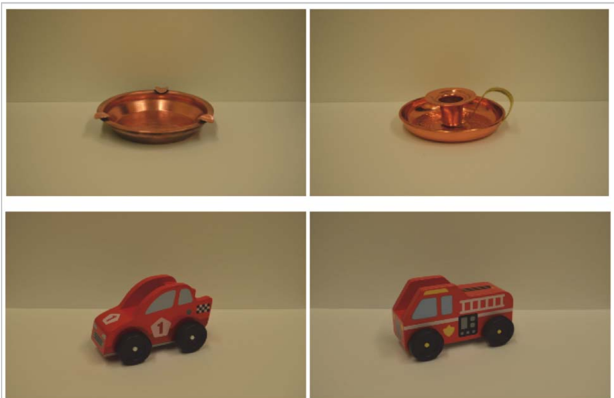
Figure 2: Variable items and their perceptually similar pair for the object recognition task.

After providing informed consent, participants were randomly assigned to the easy-item or difficult-item condition. Four action sequence videos were presented on a laptop computer using E-Prime 3.0 software (Psychology Software Tools, Pittsburgh, PA), with the four nature videos being presented after each action sequence video. E-Prime was also programmed to assign half the participants to the standard condition, and half to the condition with a deviant order presented. In the deviant condition, the action sequence with a deviant order was presented in the second position in the presentation of the four action sequence videos.