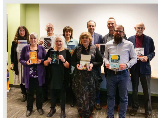
U of R authors pose with their works.