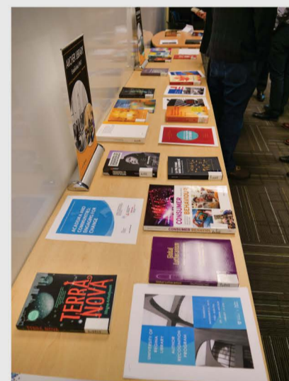
Attendees had the opportunity to view the works being celebrated.

To view the program from the 5th Annual University of Regina Library Author Recognition Reception, click here .