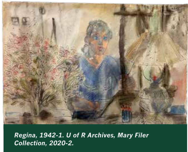
Regina, 1942-1.